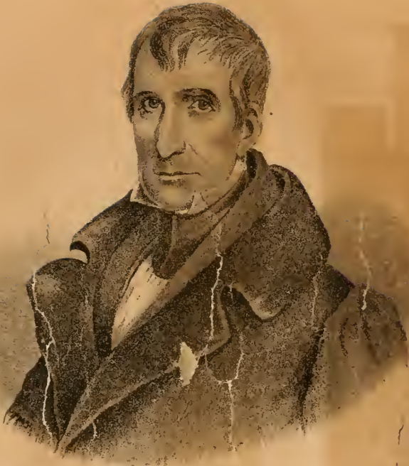
GEN. W. H. HARRISON